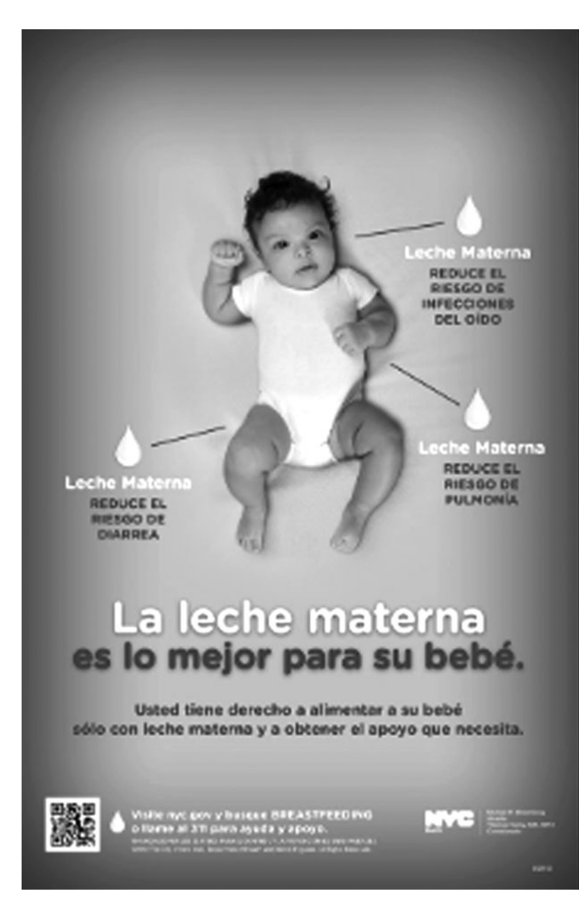
FIG. 4. New York City Department of Health poster, 2012.

while breastfeeding, and the effects on the infant.<sup>48,49</sup> Anecdotal evidence shows that mothers will discontinue breastfeeding while on antibiotics, antidepressants, or antiepileptics either as a result of direct instruction or assumption about the risk to their infant. They should be educated early that many common medicines are safe to use while breastfeeding, and at the very least enlightened about available resources to verify which medicines are compatible with breastfeeding.