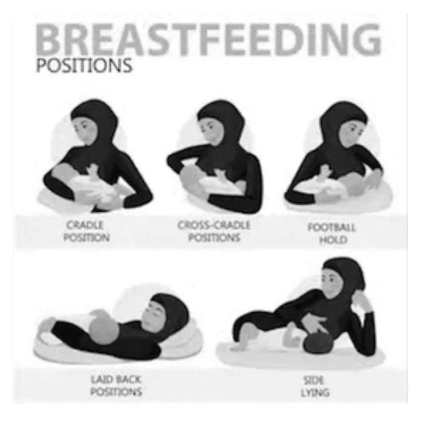
FIG. 3. Breastfeeding positions.

7. Considerations when providing prenatal care