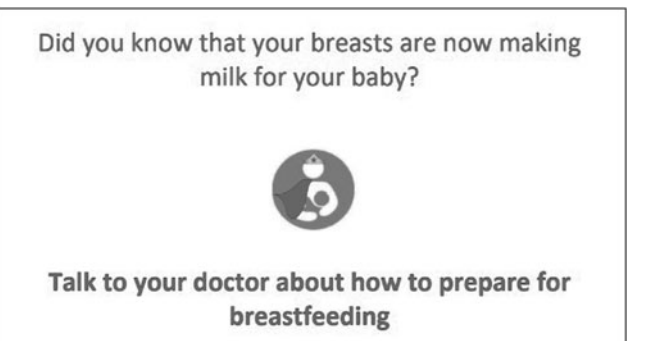
FIG. 5. "You are making milk" given to Crozer-Chester Medical Center patients after 20 weeks during an anatomy ultrasound. Created by Dr. Swathi Vanguri.

Physician interaction with the breastfeeding dyad in the immediate postpartum period depends on the system of health care and insurance systems within the country. For example, if you are in a system in which you see infants while in-hospital, you can collaborate with local hospitals and maternity care professionals within your community<sup>50,51</sup> and provide your office policies on breastfeeding initiation within the first hour after birth to delivery rooms and newborn units.